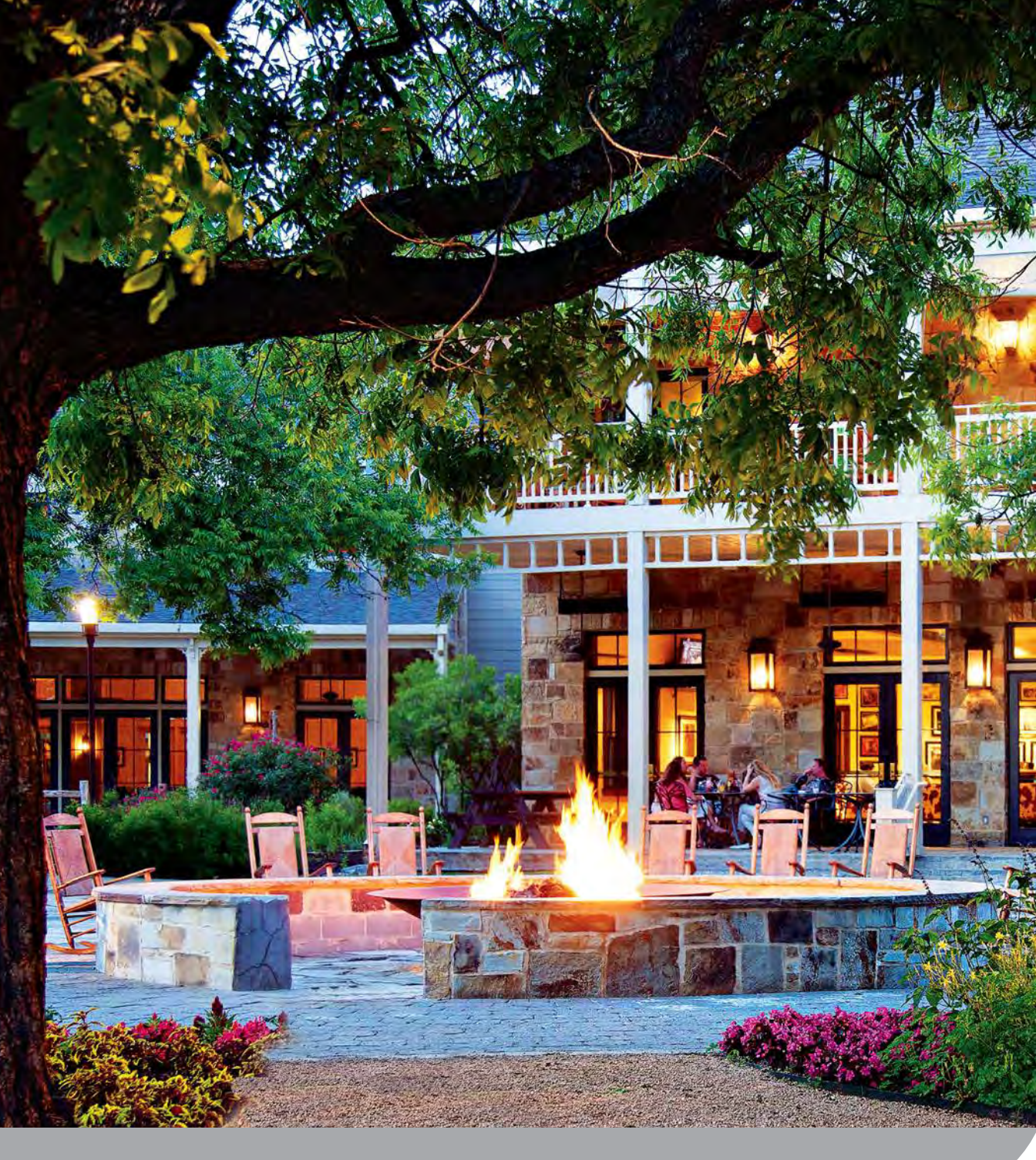
HYATT REGENCY LOST PINES Resort & Spa